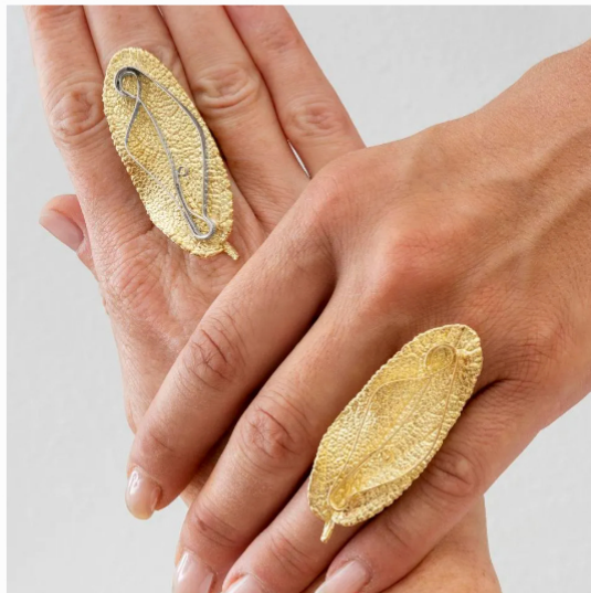
The Salvia (Sage) ring By Giuseppe Penone, 18ct yellow gold ELISABETTA CIPRIANI GALLERY